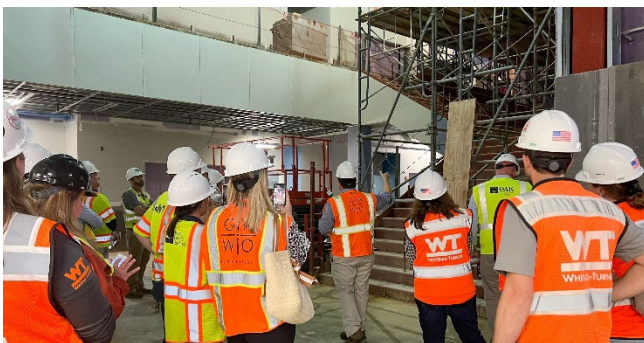
2022 Project Tour - New Northeast Area Elementary School CMAA Baltimore | SMPS Maryland Joint Event