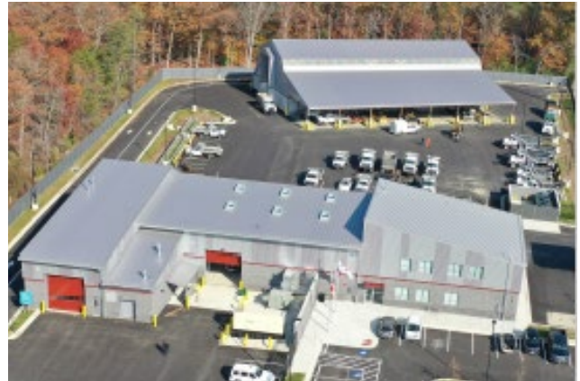
2022 Overall Project Achievement Award | Between $5M & $15M Brandywine Highway Maintenance Facility (Government) Prince George's County DPW&T | KCI