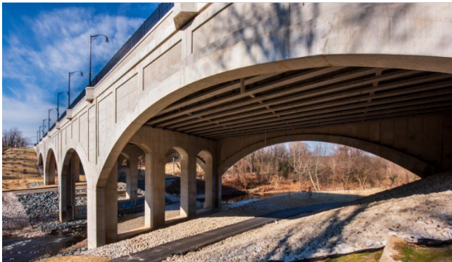
2022 Project Achievement Award | Greater Than $15M Edmondson Avenue Bridge Replacement (Transportation) Baltimore City DOT | JMT