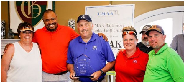
2022 CMAA Baltimore Awards Banquet

Shortlisted firms will be encouraged to submit a display board highlighting the project at the event. Details to follow.