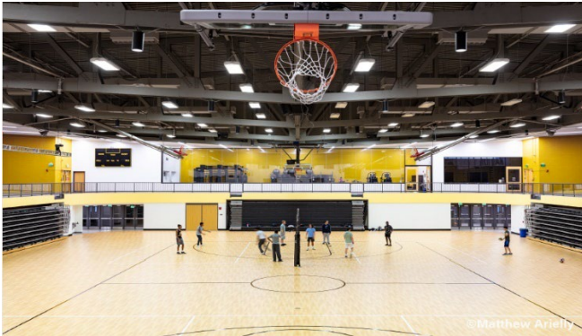
2022 Project Achievement Award | Greater Than $15M Retriever Activity Center (Education) UMBC | Quandel