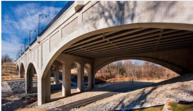
2022 Project Achievement Award | Greater Than $15M Edmondson Avenue Bridge Replacement (Transportation) Baltimore City DOT | JMT