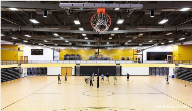
2022 Project Achievement Award | Greater Than $15M Retriever Activity Center (Education) UMBC | Quandel