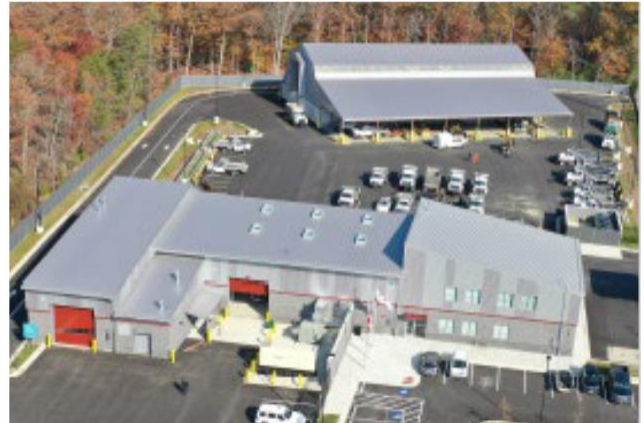
2022 Overall Project Achievement Award | Between $5M & $15M Brandywine Highway Maintenance Facility (Government) Prince George's County DPW&T | KCI