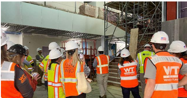
2022 Project Tour - New Northeast Area Elementary School CMAA Baltimore | SMPS Maryland Joint Event